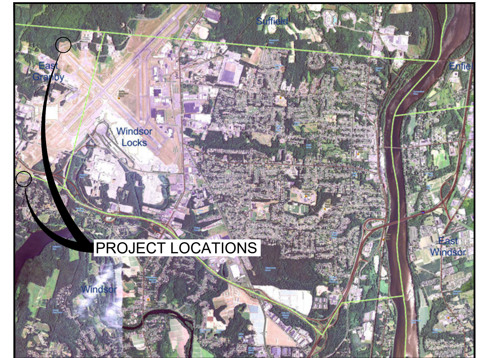
PROJECT LOCATION MAP NOT TO SCALE